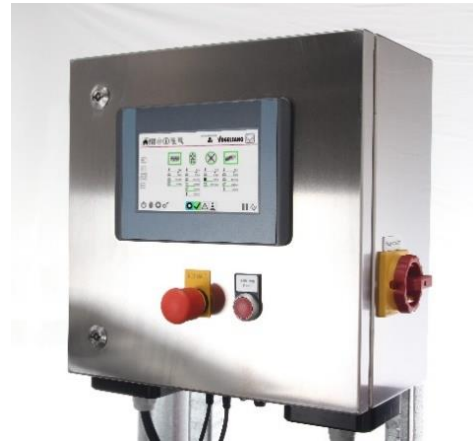
Image 2: Performance Control Unit (PCU): the user interface offers quick and easy access to all operating data.