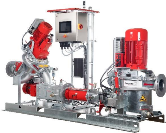
Image 1: Completely preassembled system solution for mechanical disintegration (consisting of RotaCut, progressive cavity pump and DisRuptor).