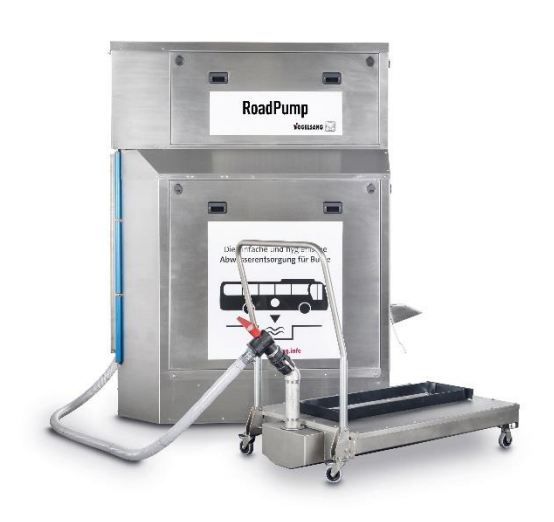
Image 2: The RoadPump Plus covers the entire range of water services for buses: wastewater disposal, supply of flushing and drinking water.